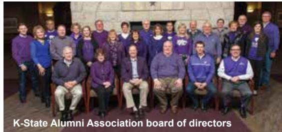
K-State Alumni Association board of directors

Helping future K-Staters with scholarships is a priority for many alumni. I'm pleased to report that the Alumni Association was able to pay more than $300,000 in scholarships to K-State students in 2014 — all through the help of funds provided by alumni and friends. Our Wabash CannonBall gala in Kansas City has raised more than $2 million and awarded more than $630,000 in scholarships since 2007. Adding to the success of that event was the addition of a second