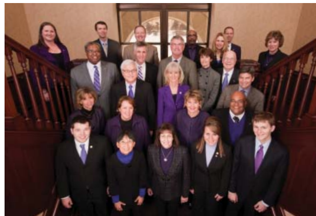
K-State Alumni Association Board of Directors