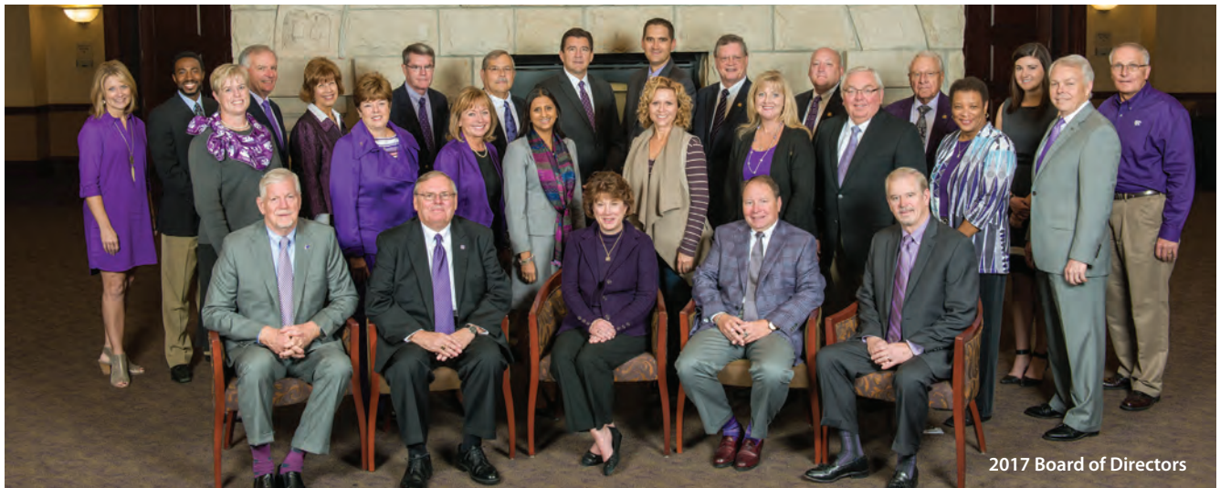
2017 Board of Directors