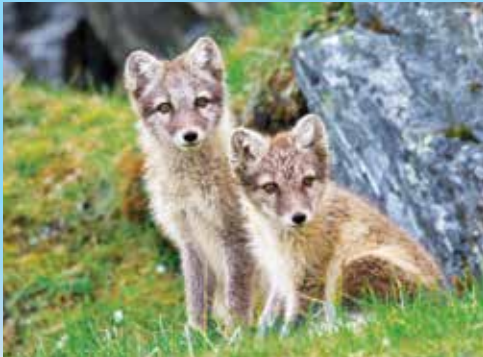
Native to the Arctic tundra biome, Arctic foxes use their acute hearing to locate prey precisely.