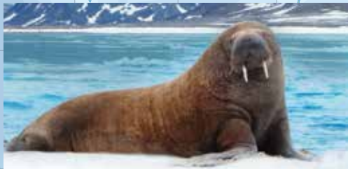
Watch for "Arctic Giants," enormous walrus weighing up to 1.5 tons.

In the bell-shaped sound of Bellsund, surrounded by soaring, snow-covered peaks, anchor off Calypsobyen, part of