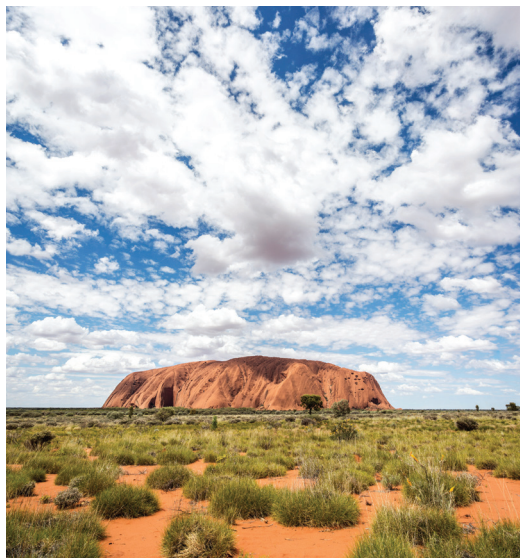
We visit the Aboriginal site of Uluru (Ayers Rock) on Day 6.