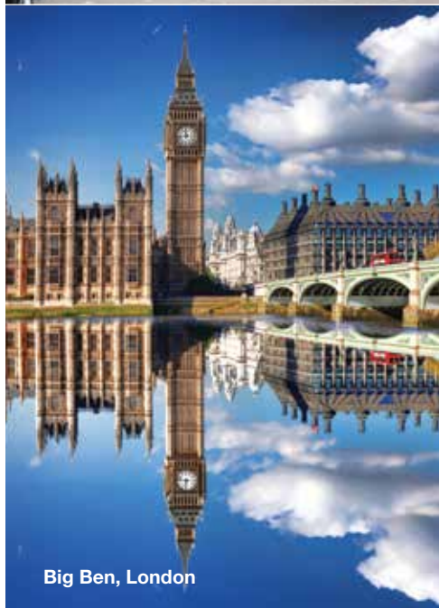
Big Ben, London