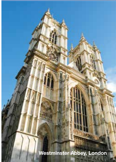
Westminster Abbey, London