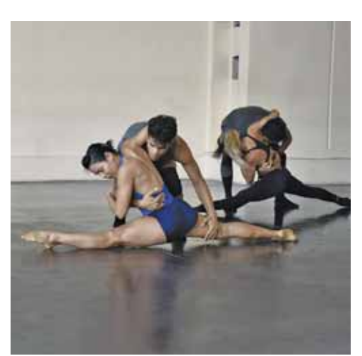
Contemporary dance studio, Havana

Continue to Casa de la Cultura, an inspiring community center committed to promoting art, culture and literature within Cuba. Interact