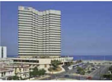
MELIÁ COHIBA | HAVANA

Our travel experts have selected these first-class properties, each in a prime location, for your comfort. Details in the design and décor celebrate Cuba's local culture and enhance the ambience of each hotel. Their restaurants feature menus of local and international cuisine. Of utmost importance is the quality of the services, amenities and accommodations, allowing you to maximize the enjoyment of your stay.