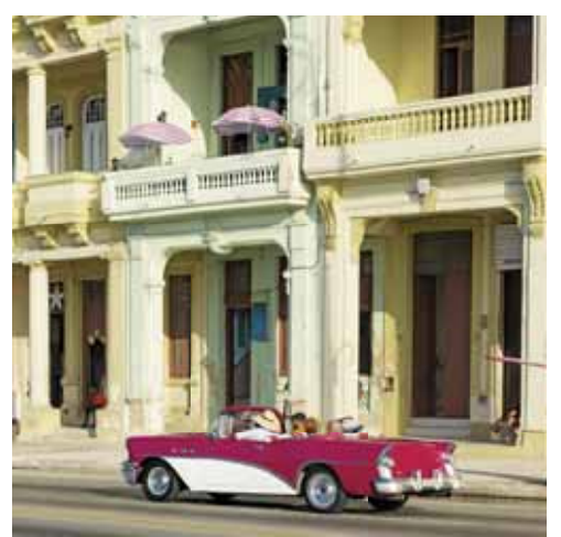
Top: Market, Trinidad | Above: Vintage car, Havana

Enrichment: Urban Planning and the Architectural Challenges in Havana. Cuban