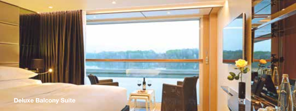
Deluxe Balcony Suite