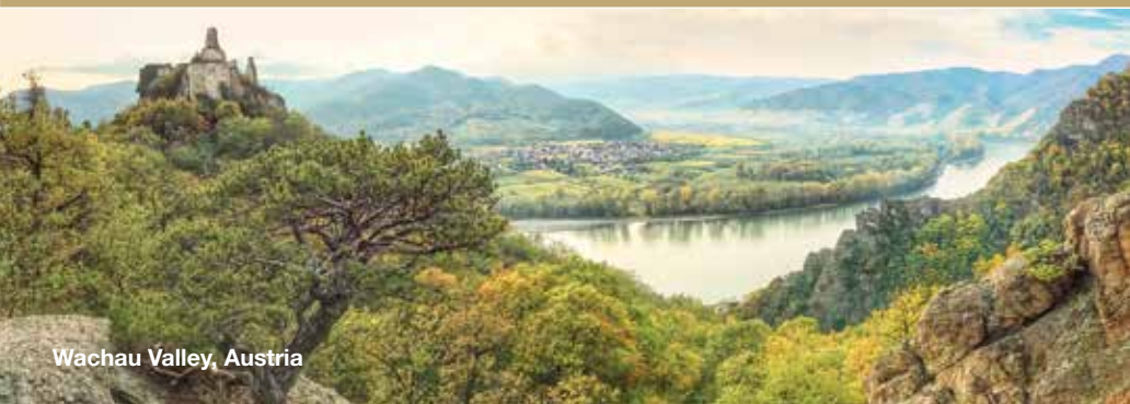
Wachau Valley, Austria

No credit card is required at cruise check-in, and Scenic's River Cruise Guarantee insures against unforeseen disruptions during your cruise.