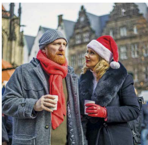
Top: Holiday market, Heidelberg | Above: Enjoying mulled wine at the holiday market

de France,” The Most Beautiful Villages of France, this lovely medieval town charms all who visit. Relish its romantic aura on a guided walk and sample some of its fabulous wines.