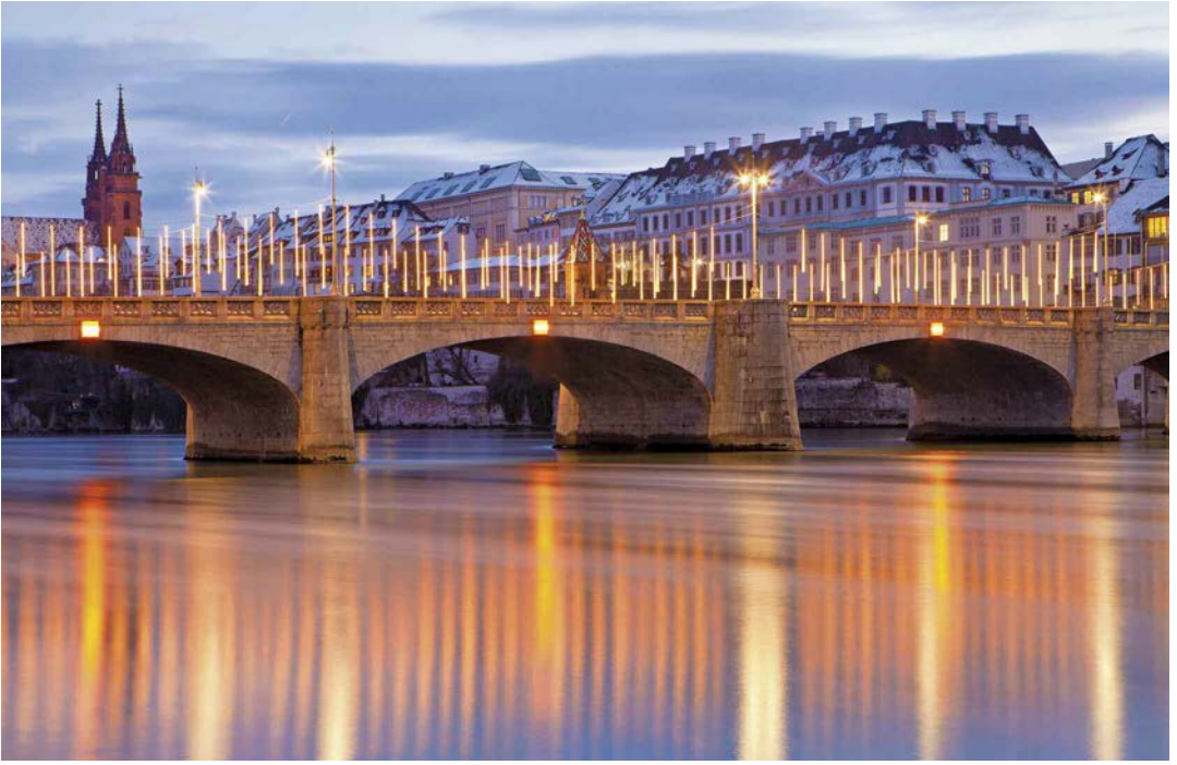
Holiday lights over the Rhine River, Basel