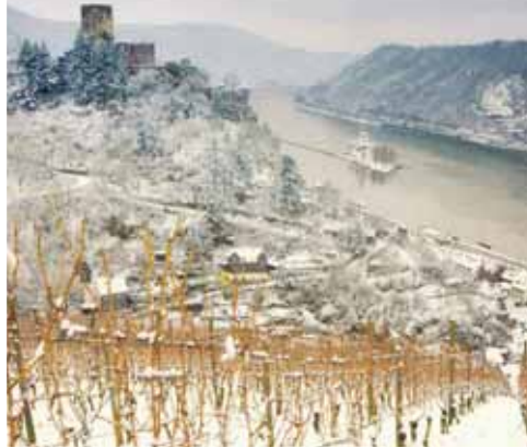
Upper Middle Rhine Valley