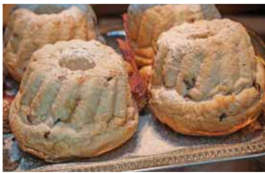
Traditional French pastry