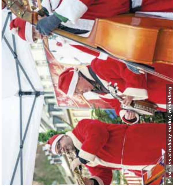
Musicians at holiday market, Heidelberg