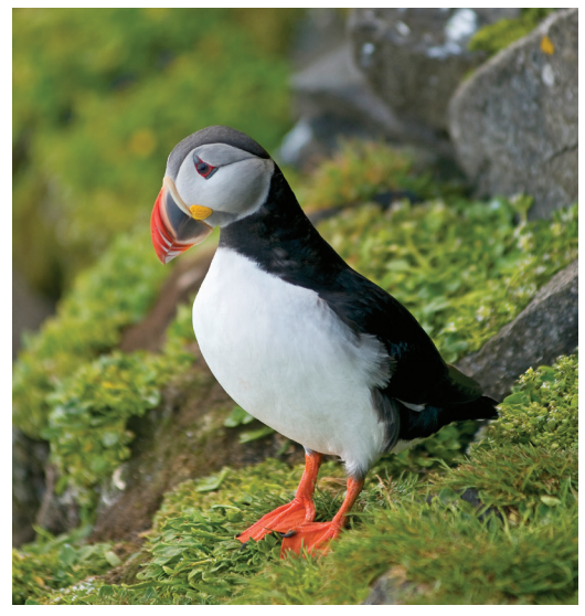
We may see puffins on our tour.