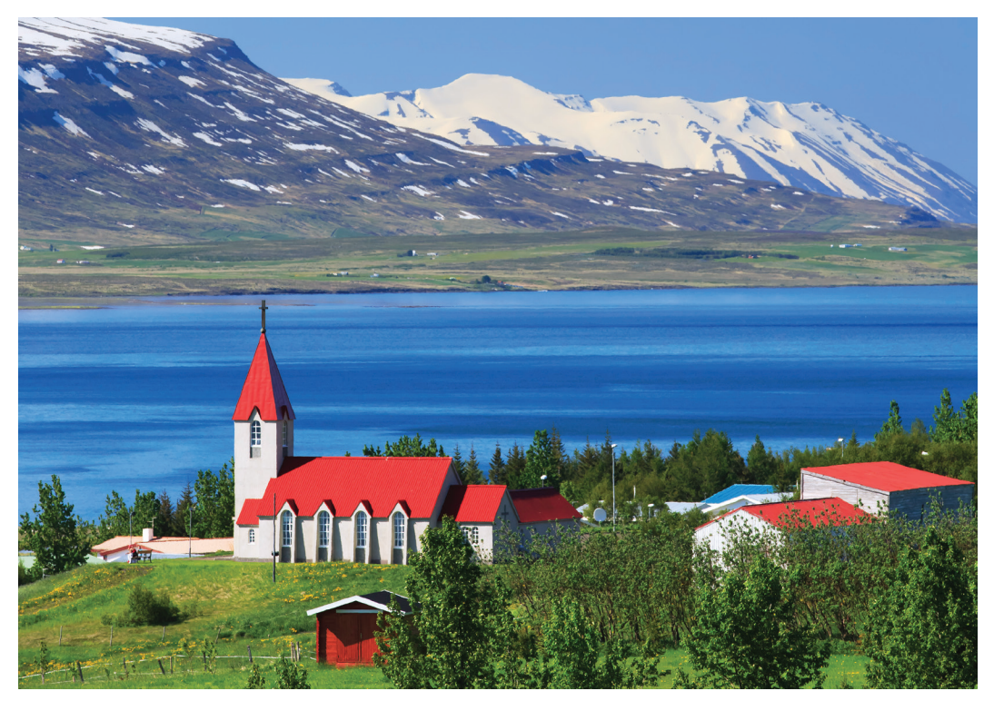
Iceland's landscape reveals an austere beauty.

sits a hoof-shaped rock called "The Island." Next, we visit Hljodaklettar Echo Cliffs, where we explore the labyrinth of "echoing rocks" created by the spiral basalt formations of the arches and canyons here. Our last stop: jaw-dropping Dettifoss, Europe's most powerful waterfall and Iceland's "Niagara." B,L,D