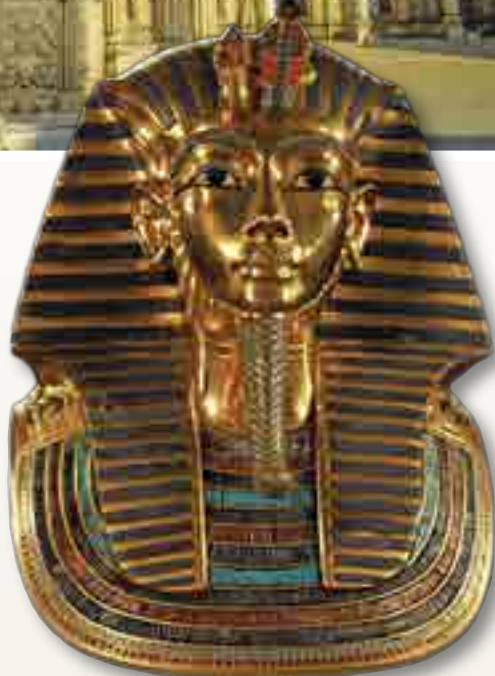
Top: Mosque of Mohammed Ali, Cairo | Above: Burial mask of Tutankhamen

Discovery: The Pyramids of Giza. View the