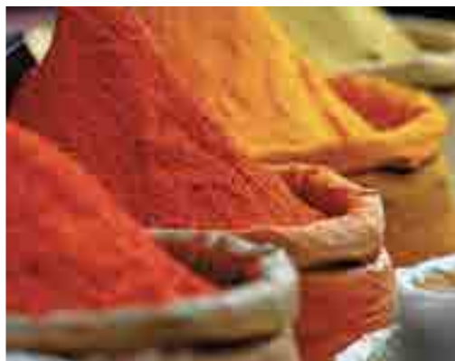
Top: The Sphinx and pyramids of Giza | Left: Cairo | Above: Spices in Khan el Khalili bazaar, Cairo

In the Solar Boat Museum, see a cedar vessel thought to be over 4,500 years old, intended as transportation for a pharaoh in the afterlife.