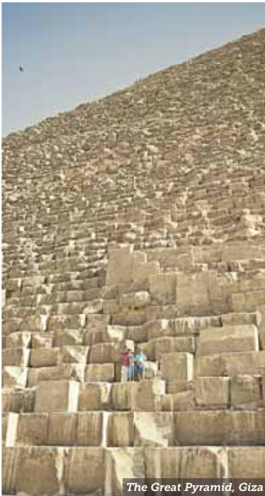
The Great Pyramid, Giza