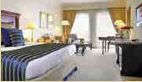
INTERCONTINENTAL CITYSTARS CAIRO | CAIRO