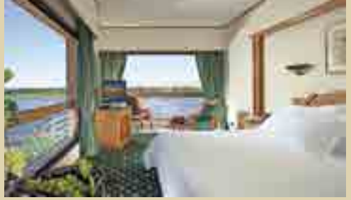
SONESTA ST. GEORGE HOTEL LUXOR | LUXOR