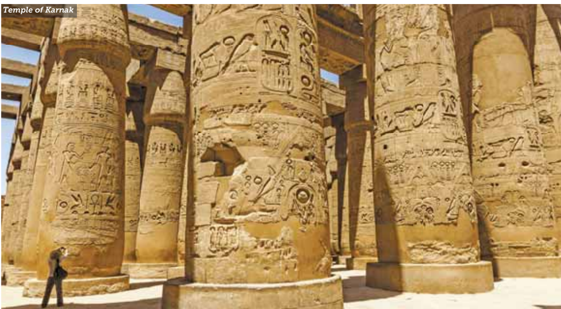
Temple of Karnak