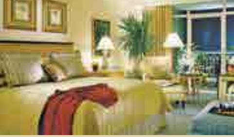
FOUR SEASONS HOTEL CAIRO AT NILE PLAZA | CAIRO