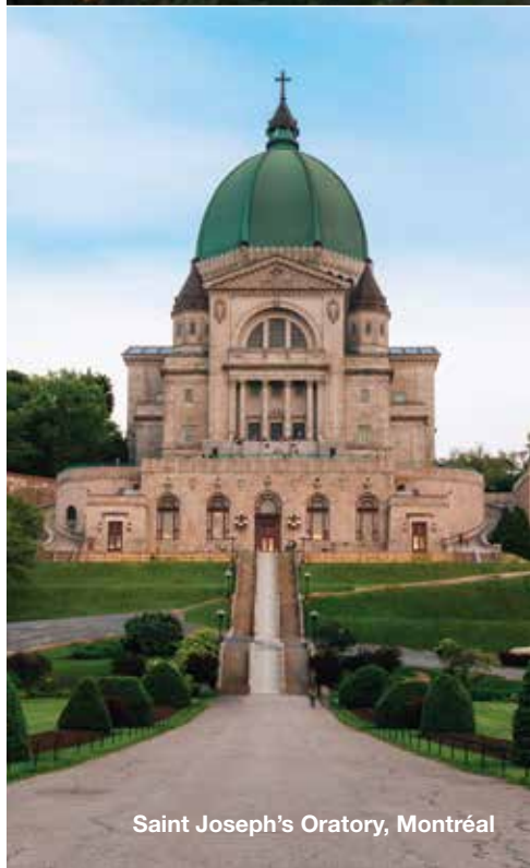
Saint Joseph's Oratory, Montréal