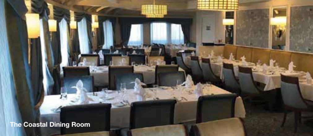
The Coastal Dining Room