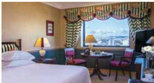
DOM PEDRO PALACE LISBON | LISBON