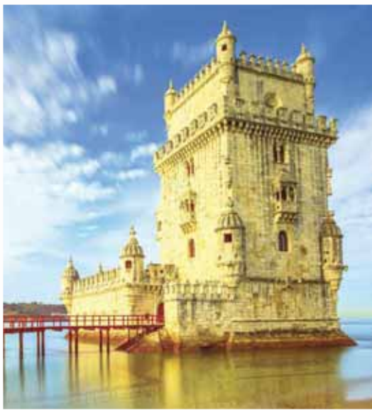
Top: Manor Solar de Mateus, Vila Real | Above: Tower of Belém, Lisbon

Enrichment: Douro Wine Country. Discuss the wine-making traditions of the Douro region with a local expert.