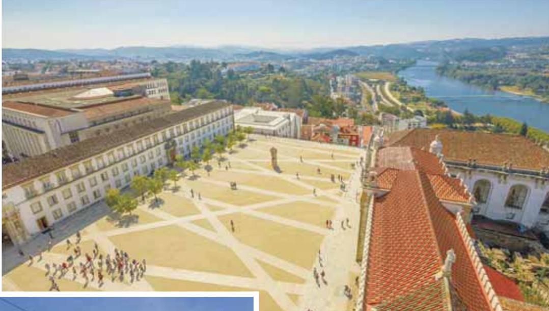
Above: University of Coimbra |