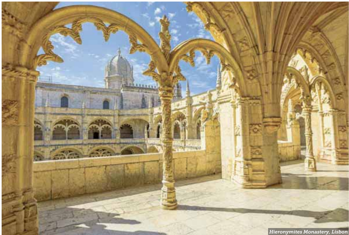
Hieronymites Monastery, Lisbon