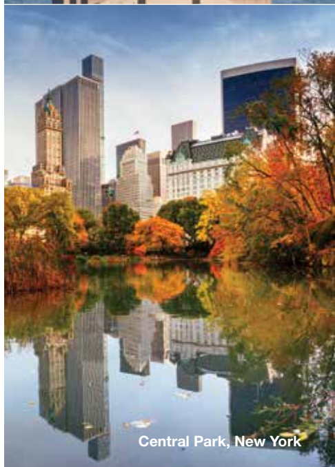
Central Park, New York