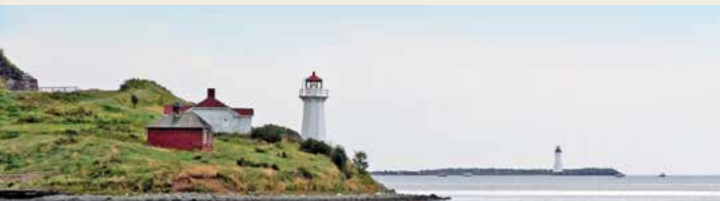
Georges Island Lighthouse, Halifax

EMAIL K-STATE ALUMNI ASSOCIATION AT TWALTERS@K-STATE.COM OR CALL GO NEXT AT (888) 664-0146 www.GoNext.com/CNE20B