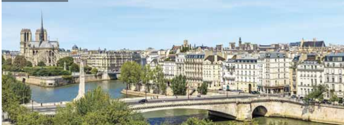
Paris, Banks of the Seine