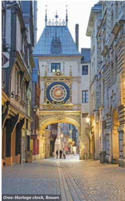
Gros-Horloge clock, Rouen