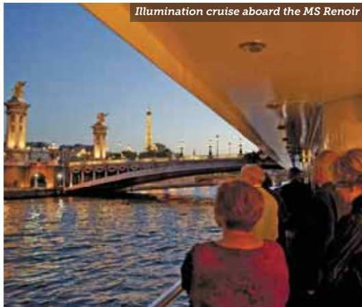
Illumination cruise aboard the MS Renoir