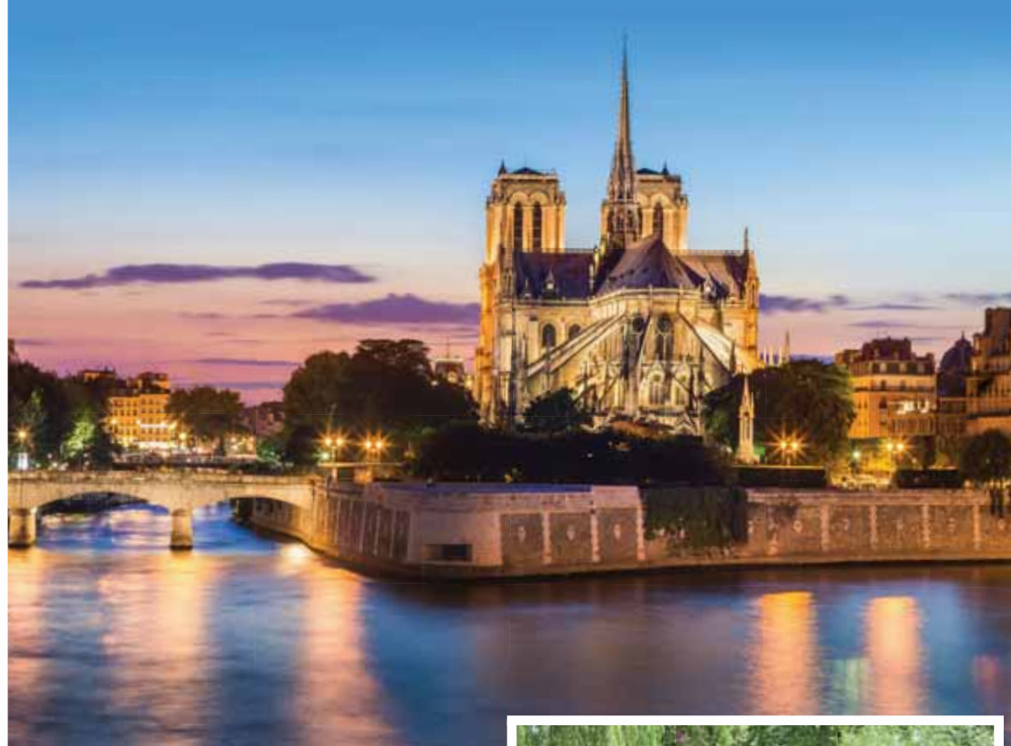
Above: Cruising the Seine at night | Right: Monet's Garden, Giverny