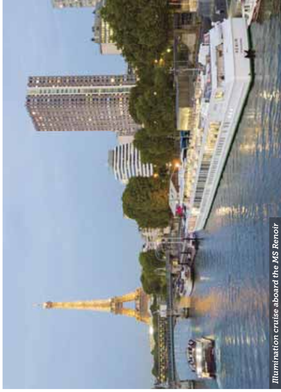
Illumination cruise aboard the MS Renoir