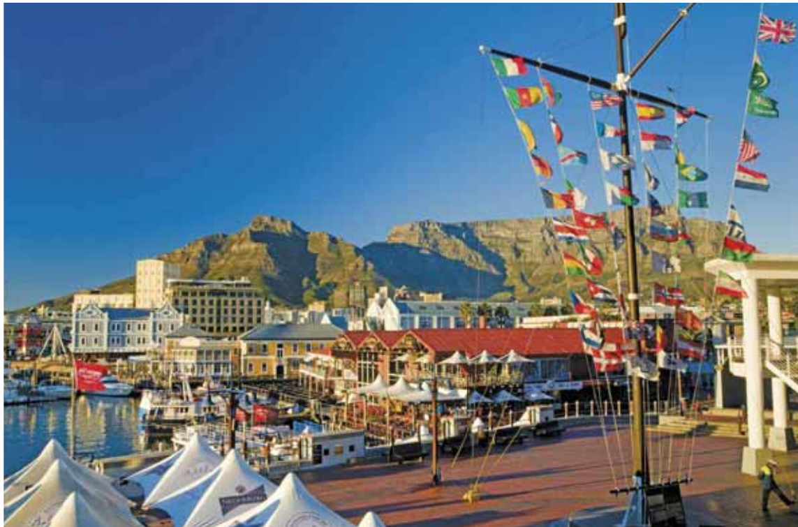
Victoria and Alfred Waterfront, Cape Town

Discover the rich natural and cultural heritage of southern Africa. Cape Town is a showcase of Cape Dutch houses and inspiring landmarks, including Robben Island and St. George's Cathedral. Across the country, Soweto, once the main battleground in the war on apartheid, now offers opportunity and hope for a better future. No trip to southern Africa would be complete without a safari in its greatest parks and game reserves. Experience the thrill of up-close encounters with lions lazing in the grass after a kill or elephants quenching their thirst by a watering hole, and feel the power of thundering Victoria Falls.