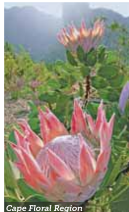
Cape Floral Region