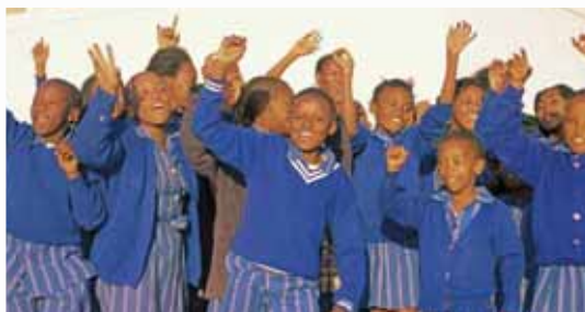
Soweto youth group