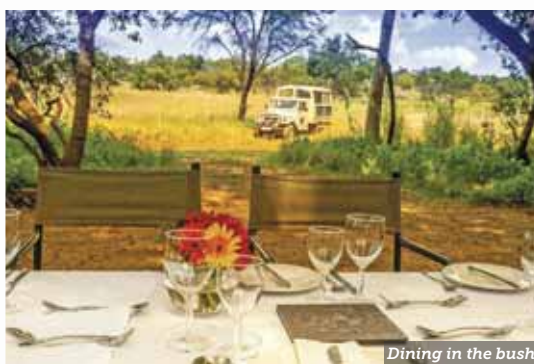
Dining in the bush

rambunctious brother. In 1886, the discovery of a huge lode of gold triggered a gold rush. Today, Joburg, as it is often called, is the country's financial center, and many people come here to enjoy the fast-paced lifestyle.