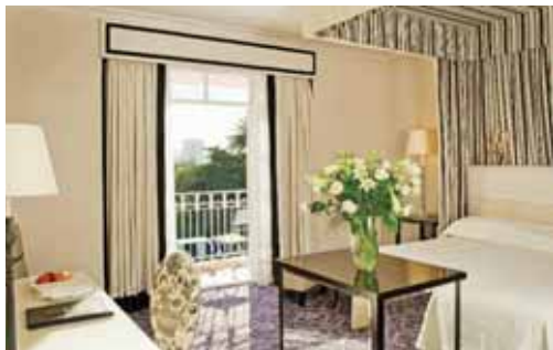
BELMOND MOUNT NELSON HOTEL | CAPE TOWN ●●●●●