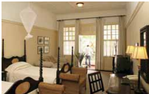
THE VICTORIA FALLS HOTEL | VICTORIA FALLS ●●●●●