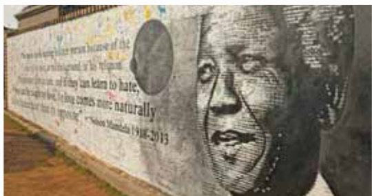
Nelson Mandela mural, Soweto

Until the 19th century, the Zambezi River's great cascade was called Mosi-oa-Tunya, "the smoke that thunders," by the local Kololo tribe. "Discovered" in 1855 by Dr. David Livingstone and renamed for England's queen, Victoria Falls spans more than a mile. Twice the height of Niagara Falls, mighty Victoria Falls casts a veil of spray that at times can be seen up to 50 miles away.