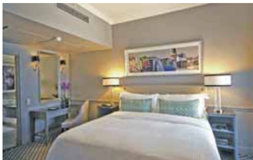
54 ON BATH | JOHANNESBURG ●●●●●