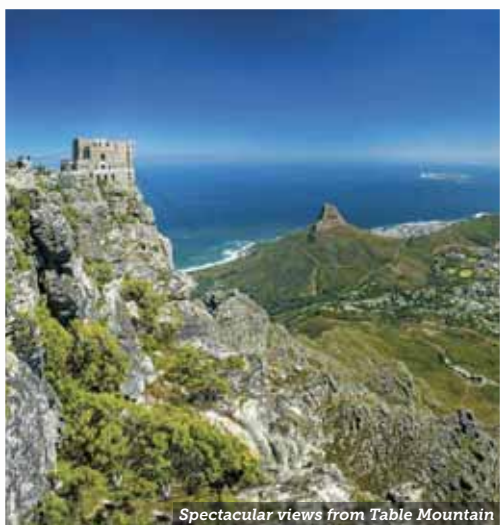
Spectacular views from Table Mountain