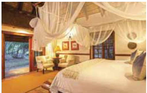
WATERSIDE LODGE | THORNYBUSH NATURE RESERVE ●●●●●

Our travel experts have selected these luxury properties for your comfort. The hotels' prime locations put the cities at your doorstep, and the game lodges sit in the heart of game-rich parks, allowing you to immerse yourself fully in the safari experience. Details in the design and décor celebrate the local culture and enhance the ambience of each hotel and lodge. Their restaurants feature menus of elegantly prepared local and international cuisine. Of utmost importance is the superior quality of the services, amenities and accommodations, allowing you to maximize the enjoyment of your stay.