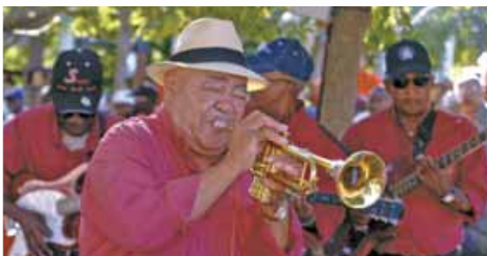
Musicians, Cape Town

If tranquil Cape Town is the country's oldest and most genteel city, Johannesburg is its