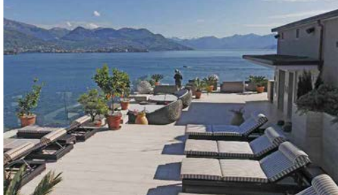
Terrace, Hotel La Palma