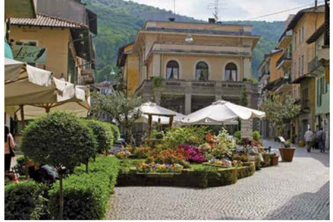
Top: Lake St. Moritz | Above: Stresa

Discovery: Bernina Express. Wind your way from craggy mountain peaks to palm-lined streets during a train ride to Tirano, Italy. The