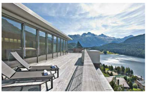
Terrace, Hotel Schweizerhof