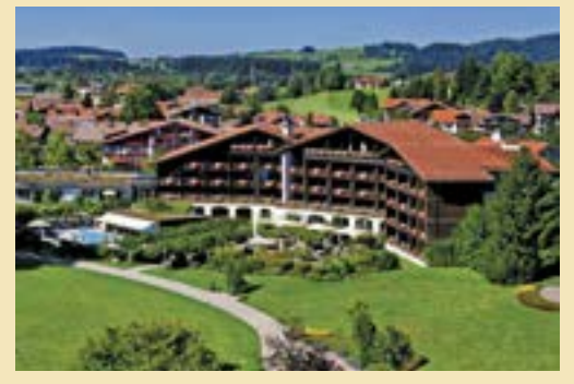
LINDNER PARKHOTEL & SPA | OBERSTAUFEN