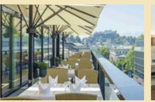
IMLAUER HOTEL PITTER SALZBURG | SALZBURG