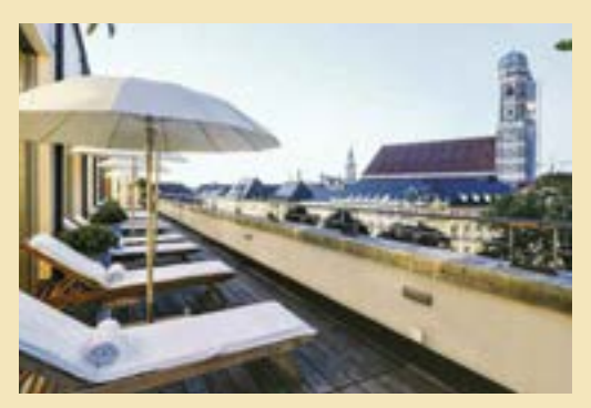
HOTEL BAYERISCHER HOF | MUNICH