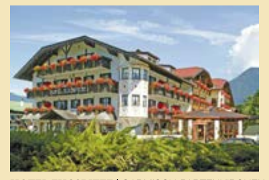
HOTEL ZUGSPITZE | GARMISCH-PARTENKIRCHEN