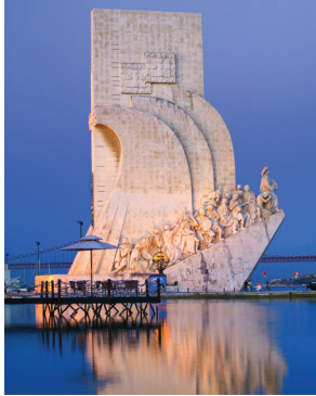
Lisbon’s Monument to the Discoveries

Day 13: Madrid Our morning tour of this monumental and dignified capital city includes vast Plaza Mayor, the Moorish medieval district, and opulent 18 th -century Palacio Real (Royal Palace). Then we