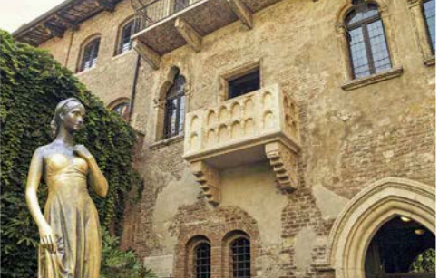
Above: Piazza Bra, Verona | Inset: Juliet's Balcony, Verona

beauty of Italy's largest lake has long inspired poets and writers. Appreciate its allure as you travel to glamorous Sirmione, a resort town on a narrow peninsula at the lake's southern end, known for its ruins of a Roman villa and Rocca Scaligera, a 13th-century castle. Cruise across the shimmering water to picturesque Lazise.