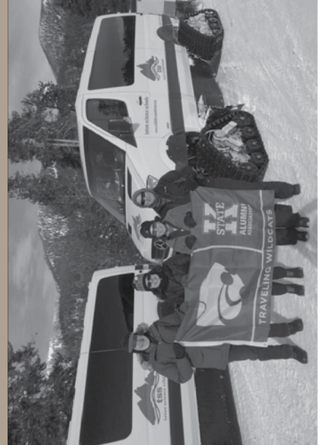
Kansas State alumni travelers on Orbridge's Wolves of Yellowstone