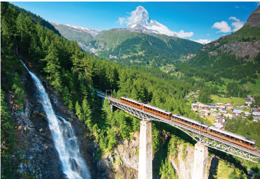
The legendary Glacier Express

Day 14: Depart for U.S. We transfer today to the Munich airport for our return flight to the U.S. B