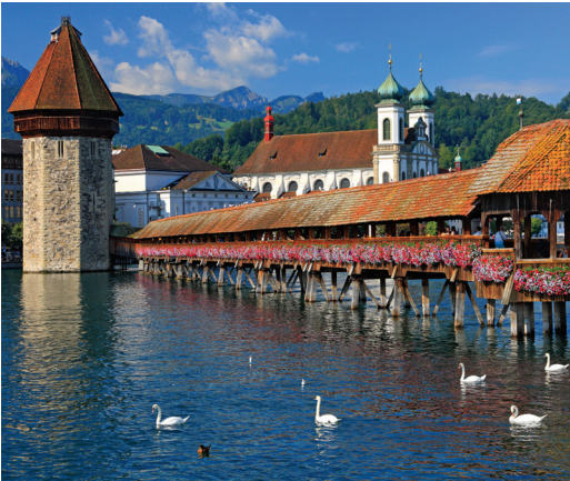
Lucerne’s beloved Kapellbrücke (Chapel Bridge)