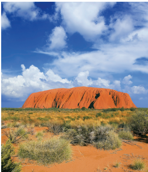
We visit the Aboriginal site of Uluru (Ayers Rock) on Day 8.