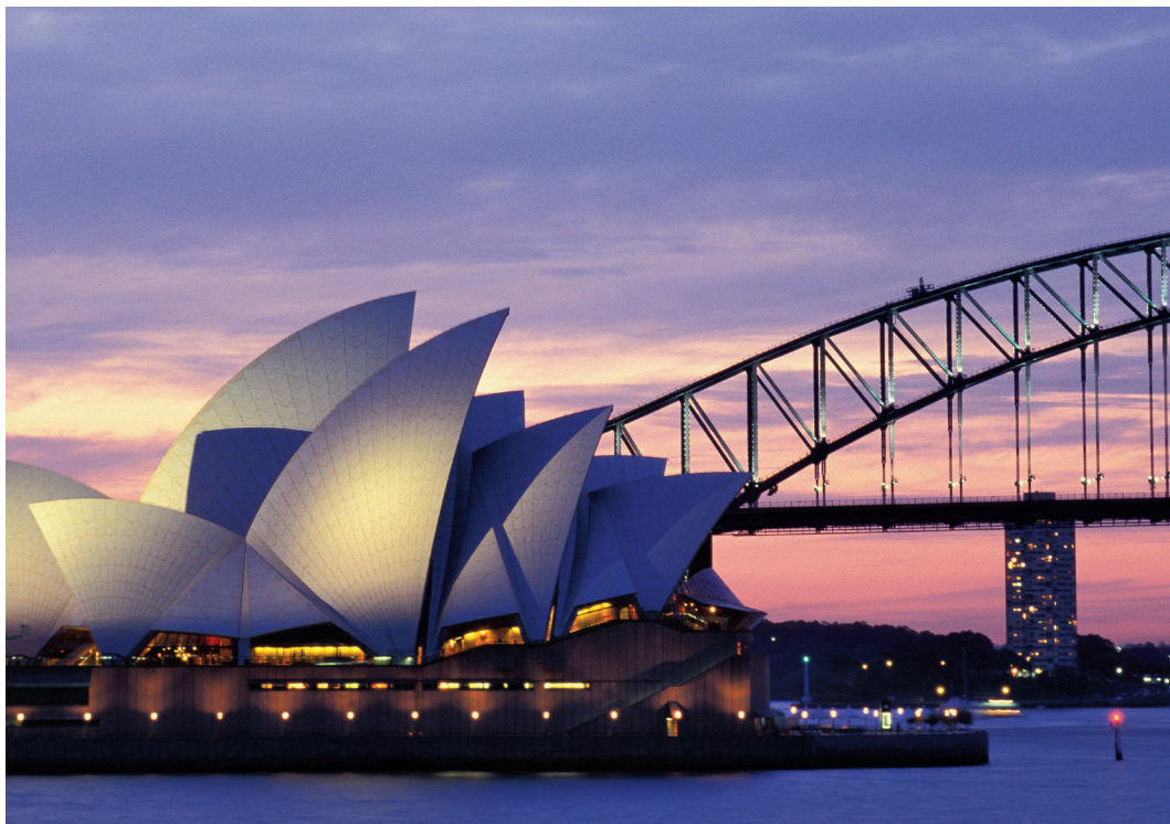
The Sydney Opera House and Harbour Bridge at dusk

Day 9: Ayers Rock/Sydney This morning we visit the base of Uluru and the interesting museum here. Mid-day we fly to Sydney, arriving late afternoon. B,D