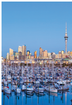
Auckland, City of Sails

Day 18: Queenstown/Rotorua We depart today for the Maori center of Rotorua, with its geysers, bubbling mud pools, and hot thermal springs. Upon arrival, we take a panoramic tour of this city on the shores of Lake Rotorua. This evening we visit Tè Puia Thermal Reserve and Cultural Centre for a traditional hangi dinner and Maori performance. B,D