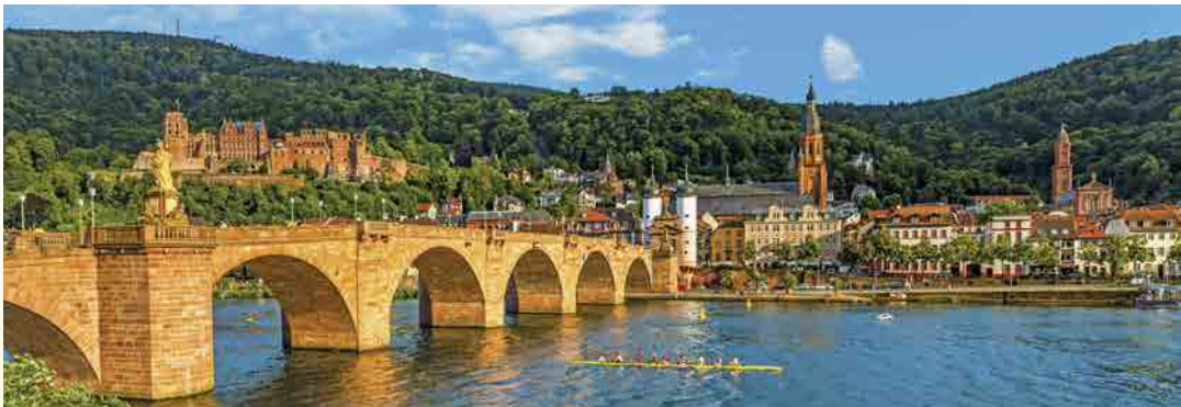
Top: Heidelberg Castle | Above: Heidelberg

• Strasbourg Canal Cruise and Petite France. Fishermen and tanners once lived in the half-