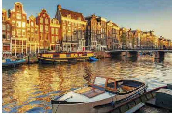
Top: Cologne Cathedral | Above: Historic Dutch architecture along canal, Amsterdam

Free Time: Make your own plans in Amsterdam.