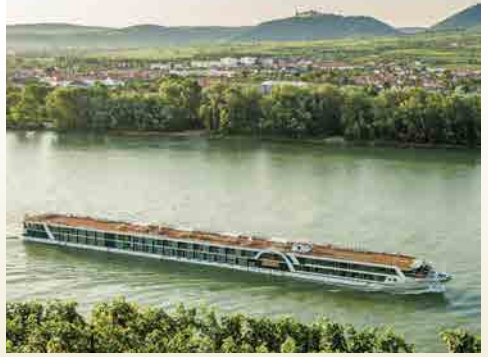
Sister ship MS Amadeus Queen sailing

Aboard the elegant, 84-cabin MS Amadeus Imperial, reminiscent of a grand European hotel, cruise in exceptional comfort and style while enjoying personalized attention and warm hospitality from its seasoned crew. Christened in 2020, its inviting public spaces feature large windows that offer remarkable, broad views of the scenery. When you want to unwind, indulge in a massage or head to the River Terrace. Savor a hearty breakfast on board, and relish regional and international specialties served with wine, beer and soft drinks at lunch and dinner. Each evening, relax in your cabin or suite, which features satellite TV and a private bathroom with a shower. Wi-Fi is complimentary.