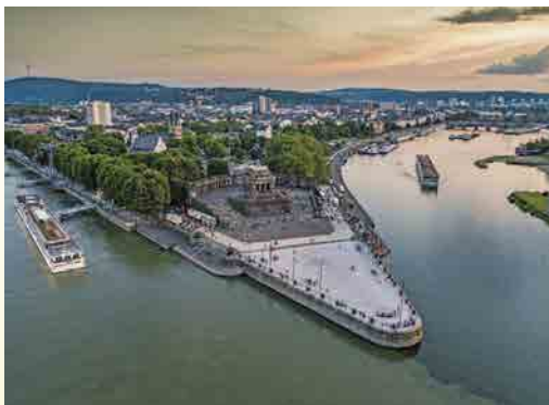
German Corner where the Mosel and Rhine meet, Koblenz

• A Musical Walk in Time. Stroll along medieval walls and down Drosselgasse in Rudesheim's Old Town and visit a captivating museum of self-playing mechanical musical instruments. (Active)