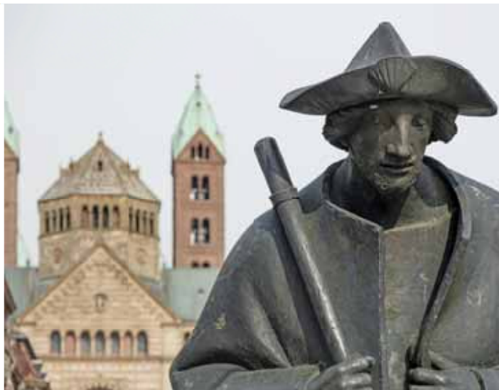
Pilgrim monument at Speyer Cathedral