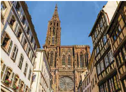
Facade of Notre Dame Cathedral, Strasbourg

As the ship sails toward Basel, Switzerland, join your fellow travelers for a festive Farewell Reception and Dinner this evening.