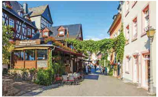
Top: Upper Middle Rhine Valley | Above: Rudesheim

Sail amid stunning scenery in the Upper Middle Rhine Valley, a gently curving, 40-mile stretch dotted with hilltop castles and fortress ruins.