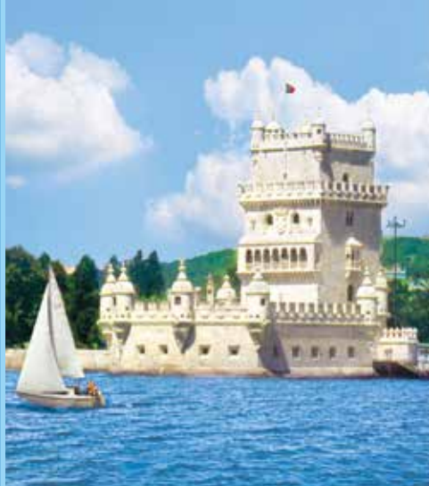
Watchmen surveyed Lisbon's harbor from the 16 th -century Tower of Belém.

Attend the Captain's Welcome Reception and Dinner this evening.