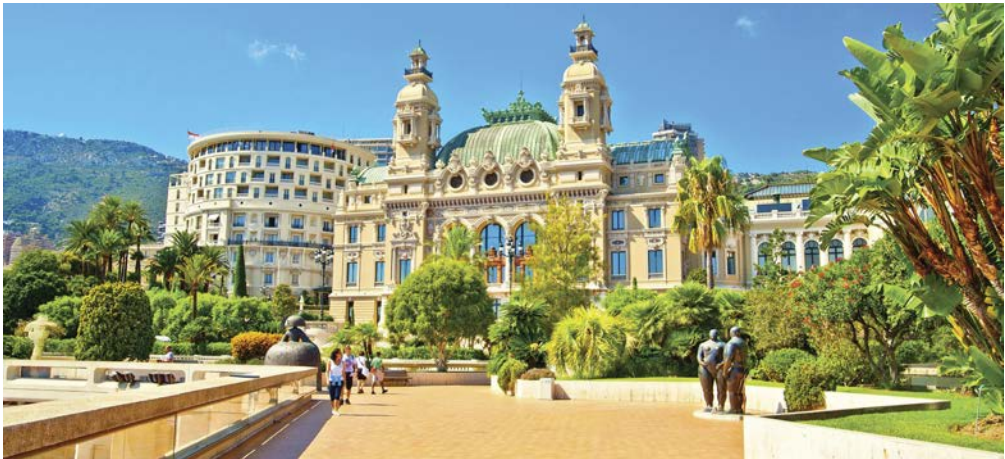
Top: Place Massena, Nice | Below: Monte Carlo

Discovery: Villa Ephrussi & Villefranche-sur-Mer. The Cap-Ferrat peninsula is a playground for glitterati and billionaires.