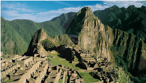
We explore the amazing ruins at Machu Picchu on Days 5 & 6.

Day 15: Quito/Depart for U.S. Nestled in Andes foothills, Quito boasts a well-preserved historic