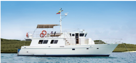
We stay in comfort for four nights in spacious rooms at the Royal Palm Hotel, set in the lush highlands of Santa Cruz island, and enjoy day cruises aboard the Santa Fe, our privately chartered yacht.