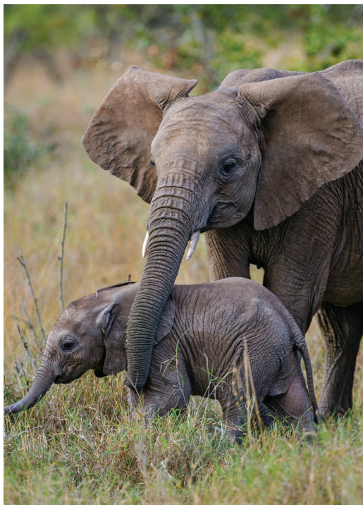
Learning the ropes ...