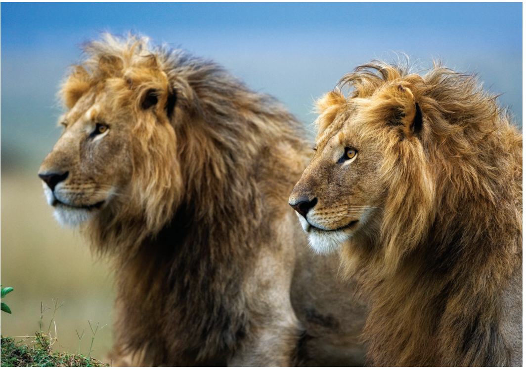
More than 3,000 lions roam the Serengeti.

the world's largest intact and perfectly formed volcanic caldera. The unique biosphere here has remained unchanged for eons; towering walls encircle the crater's floor which represents Africa in microcosm: grassland, swamps, lakes, forests, and some 25,000 mammals, including elephant, black rhinoceros, lion, hippo, and zebra. Then we return to our lodge for an afternoon at leisure. B,L,D