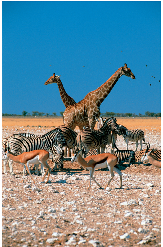
Tarangire National Park teems with diverse wildlife.

Day 10: Serengeti We embark on more wildlife drives today. We have the chance to see some – or all – of Africa's “Big Five:” lion, Cape buffalo, elephant, rhino, and leopard, along with wildebeest, zebra, eland, gazelle, and other plains animals, and some 500 species of birds. B,L,D