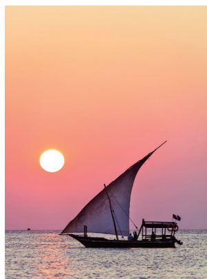
Traditional dhow sails off Zanzibar.

Day 12: Zanzibar A morning tour of a spice plantation reveals why Zanzibar is known as the “Spice Island” – its bounty of cloves, nutmeg, ginger, chilies, black pepper, vanilla, coriander, and cinnamon have found their way around the world for centuries. We